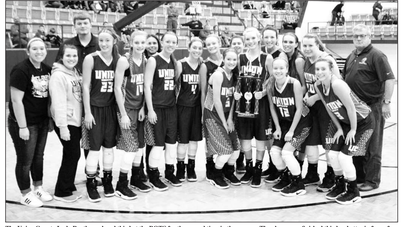
The Union County Lady Panthers placed third at the BOTS for the second time in three years. They have now finished third or better in four of the last six BOTS Christmas Tournaments.

her game-high 11 points in the first half as Union had 11 different players reach the scoring column.